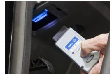
Small, easy-to-handle OBD module