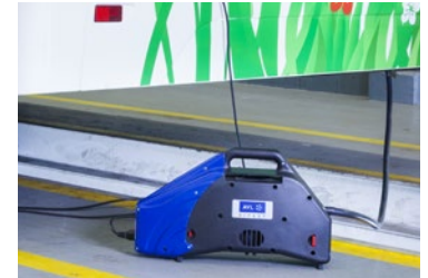
Compact, light and low-maintenance opacity measuring chamber