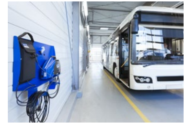
AVL DITEST MDS 305 – the exhaust emission testing device for your commercial vehicle workshop

Headquarters: DITEST Fahrzeugdiagnose GmbH Alte Poststraße 152, 8020 Graz, AUSTRIA, Tel. +43 316 787-0, Fax -1460, ditest@avl.com German branch: AVL DITEST GmbH Würzburger Straße 152, 90766 Fürth, DEUTSCHLAND, Tel. +49 911 47 57-540, Fax -477 www.avlditest.com