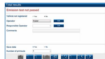
Clearly displayed results