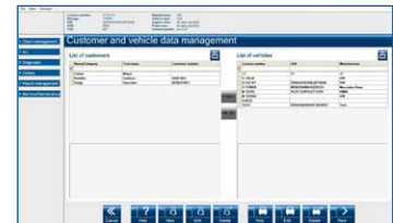
Integrated client and vehicle management

Discover for yourself just how quick and easy a pollution test can be. The system guides you precisely and efficiently through the whole process, from inputting the client, to the measurement itself, all the way through to the final report.