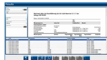
Branded results report to improve client loyalty