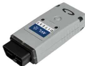
AVL DITEST VCI 1000