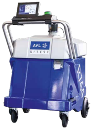
AVL DiTEST ADS 310