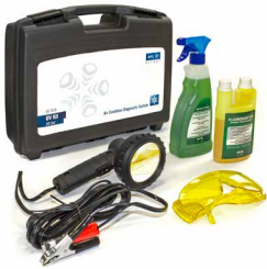
Air conditioning UV leak detection set: GE7428