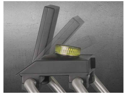
VAS 581 009 for the technology of tomorrow