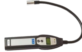
H 2 gas sniffer