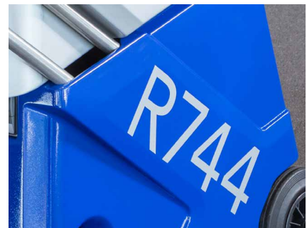
CO 2 is a natural and environmentally sustainable coolant