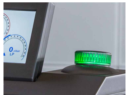
Unique operation system with adjustable display and rotary control with coloured indicators