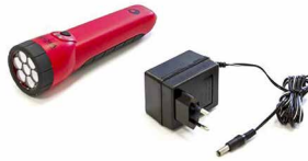
Rechargeable UV lamp: GE7448