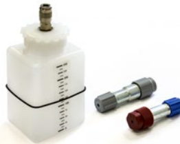
Upgrade set for hybrid vehicles