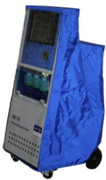
Protective cover for ADS 130D