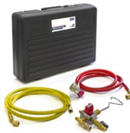
Nitrogen leak detection set