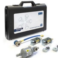
Climate control cleaning set