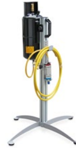
Climate control cleaning kit