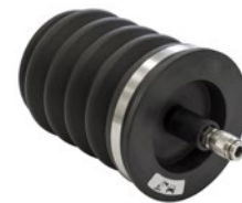
Hermetically-sealed oil container: