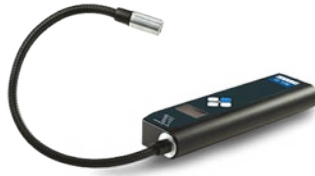
H2 gas sniffer (symbol)