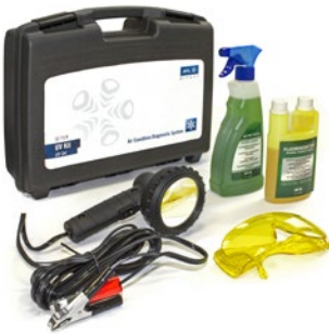
Climate control UV leak detection set